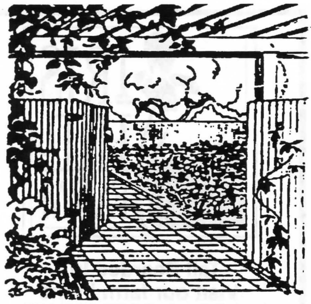
KARY IRIS GARDENS 6201 East Calle Rosa Scottsdale, AZ 85251 Tall bearded, Median, Arilbred Send for free catalog.